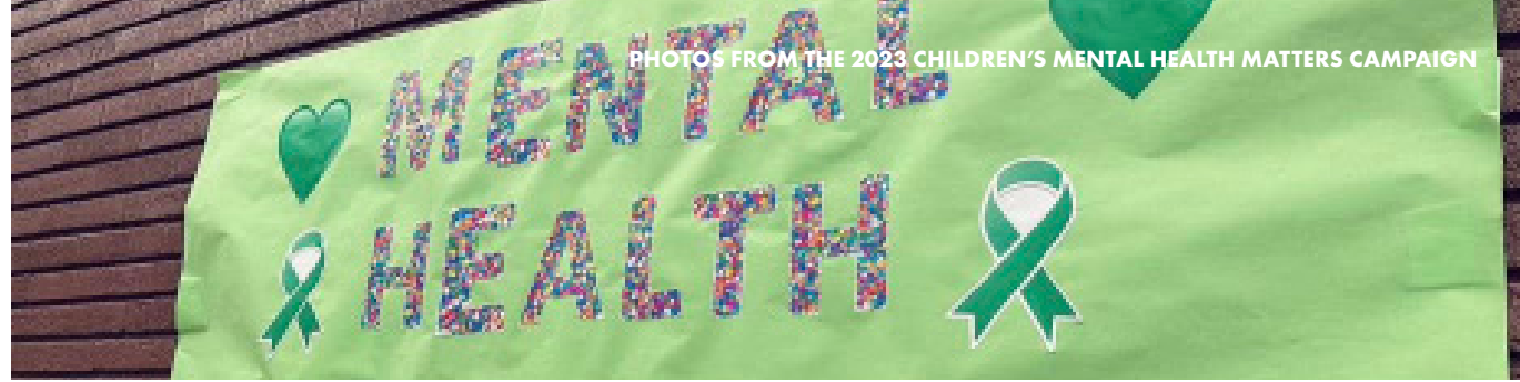
PHOTOS FROM THE 2023 CHILDREN'S MENTAL HEALTH MATTERS CAMPAIGN